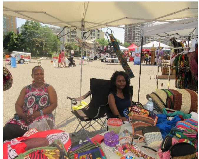
Uzima at Canada Day Multicultural event in Scarborough