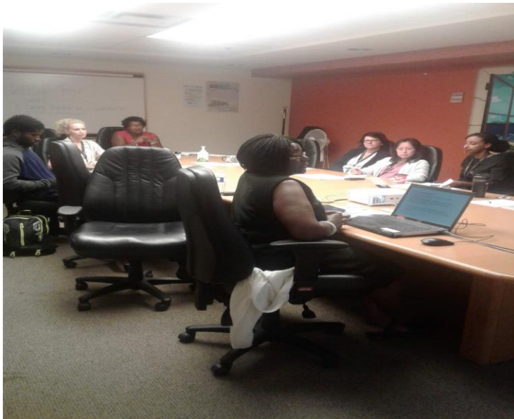
FGM/C workshop with health care providers

The Department of Justice Canada funding enabled Uzima to conduct community workshops creating awareness about Female Genital Cutting (FGC) in Toronto following the pilot research on the same topic. Participants who included women, community leaders and service providers expressed concerns about the way service providers support survivors of FGM/C. The same concerns had been expressed by participants in the initial research conducted by Uzima on experiences of survivors of FGM/C in Toronto. Recommendations from participants especially survivors included education for service providers to know how to treat survivors better. This year Uzima conducted workshops with Primary Care Practitioners. The workshops were very successful with PCP requesting other service providers including Schools, Children’s Aid Society and the Police.