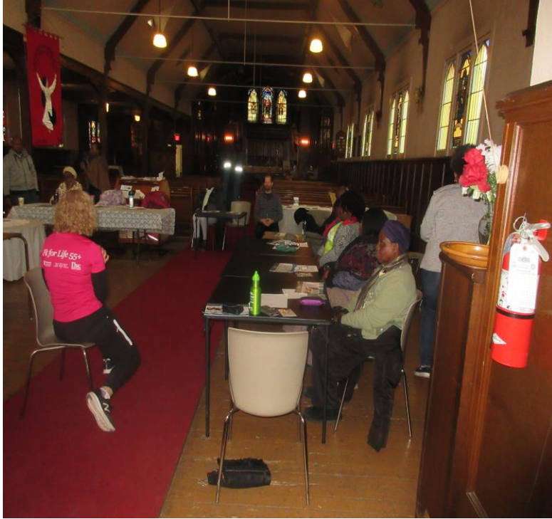
Diabetes workshop in partner with Abeingo Association of Canada